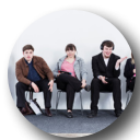
'Employable Me' Wins Canadian Screen Award P.5