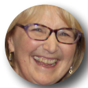
Dr. Wendy Roberts Bursary P.3